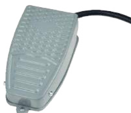
TT-VA-G ( For TT-VA-35 Vacuum Aspirator only )