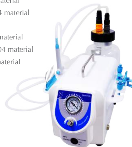
TT-VA-35 Vacuum Aspirator