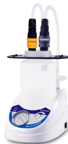
TT-VA-8 Vacuum Aspirator