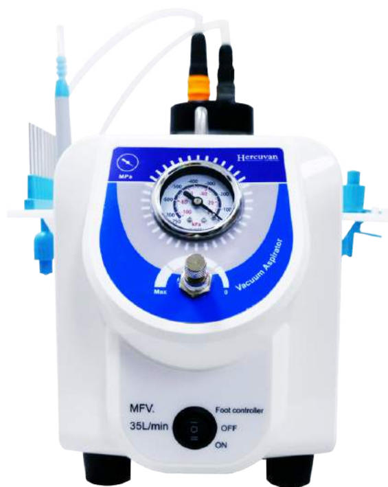
TT-VA-35 Vacuum Aspirator

The TT-VA-35 model is suitable for larger capacity samples with 2500 ml bottle and higher flow rate. Foot controller is also available as standard accessory for this model.