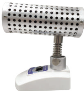
Adjustable angle heating chamber