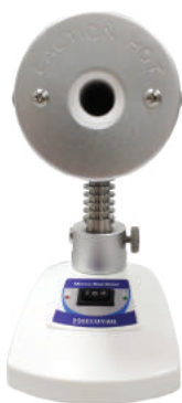
High & low temperature setting