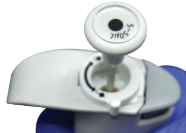
Volume range indication on plunger button enables easy identification

TT-EP2 ElitePro 2.0 Single Channel Adjustable Volume Pipette series is a new generation with improved actuation forces and approximately 20% weight reduction in overall weight compared to its predecessor, the TT-EP series. The upgraded series provides superior accuracy and ergonomics, especially for prolonged and repetitive pipetting. TT-EP2 series is available in 10 models with full adjustable volumes ranging from 0.1 \mu L – 10 mL. All ElitePro pipettes are autoclavable.