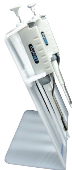
ElitePro FlexiStand accommodate most commercial pipettes conveniently