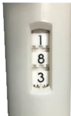
Equivalent of 4-digit micrometer system