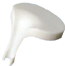
Free calibration tool provided