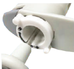
Swivel-Lock System prevents accidental volume change