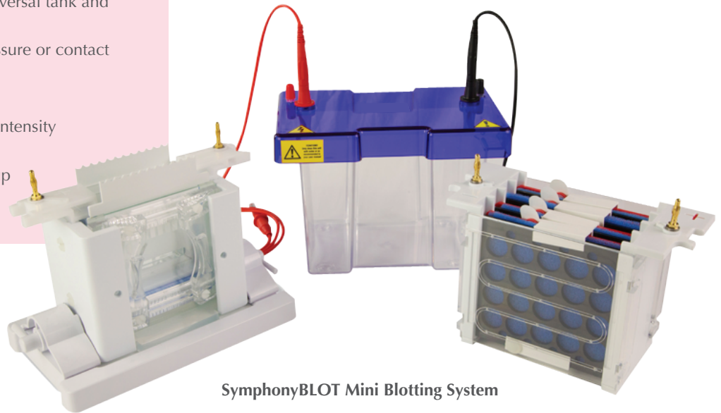
SymphonyBLOT Mini Blotting System