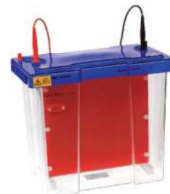
SymphonyBLOT Maxi Hi-Intensity Blotter