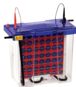
SymphonyBLOT Maxi Standard Blotter

The detachable cooling coil can be connected to the laboratory water supply or a recirculating chiller to prevent buffer depletion and allows overnight transfers while maintaining low temperatures, crucial for protein stability especially during native transfers and high-intensity blots. The hinged rigid cassettes are easy to operate and provide even contact between gel and membrane.