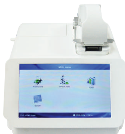
ND-2800-ODJ Nano DOT Nucleic Acid Analyzer