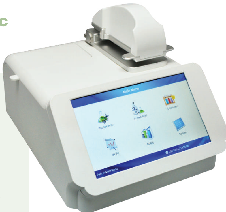
ND-3800-OD Nano DOT Microspectrophotometer