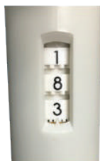
Equivalent of 4-digit micrometer system