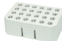
1 x TTC/H-100-MIX C (24 x 1.5ml/ 2.0 ml)