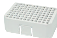
1 x TTC/H-100-MIX A (96 x 0.2 ml)