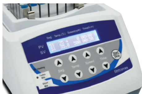
PV: Present value SV: Set value