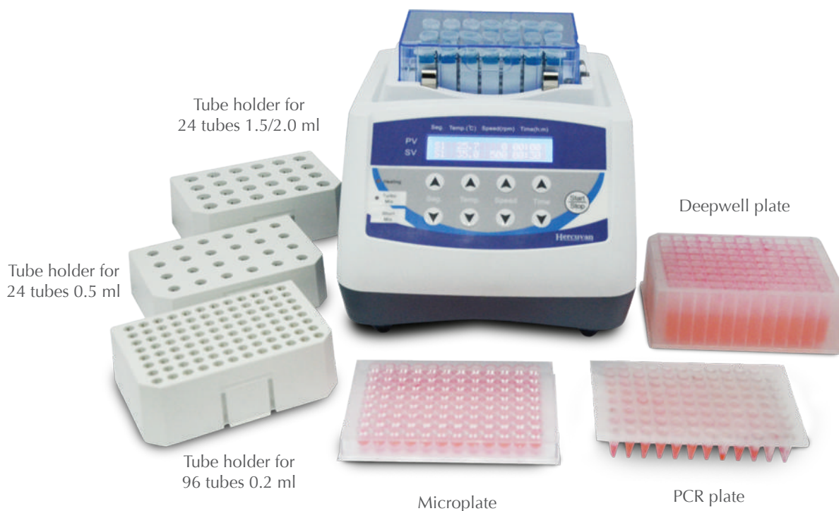
Tube holder for 24 tubes 1.5/2.0 ml