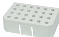
1 x TTC/H-100-MIX B (24 x 0.5 ml)