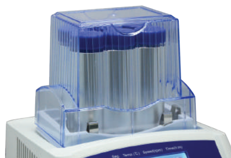
Extended height cover lid