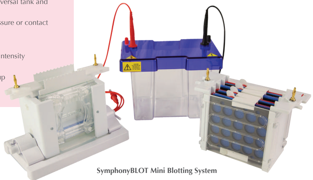
SymphonyBLOT Mini Blotting System